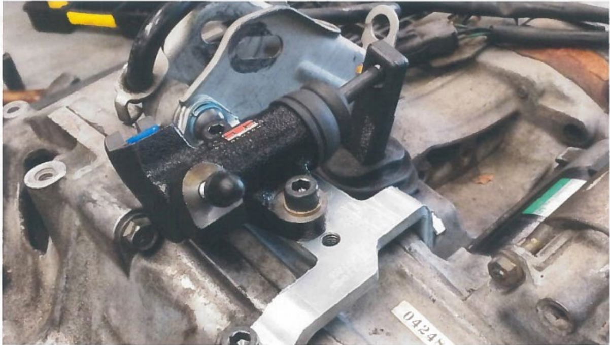
Hydraulic slave cylinder and bracket installed