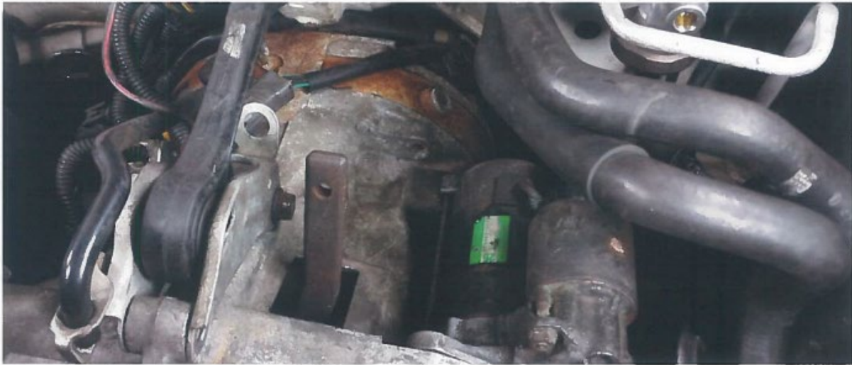
Factory release hydraulics removed closeup