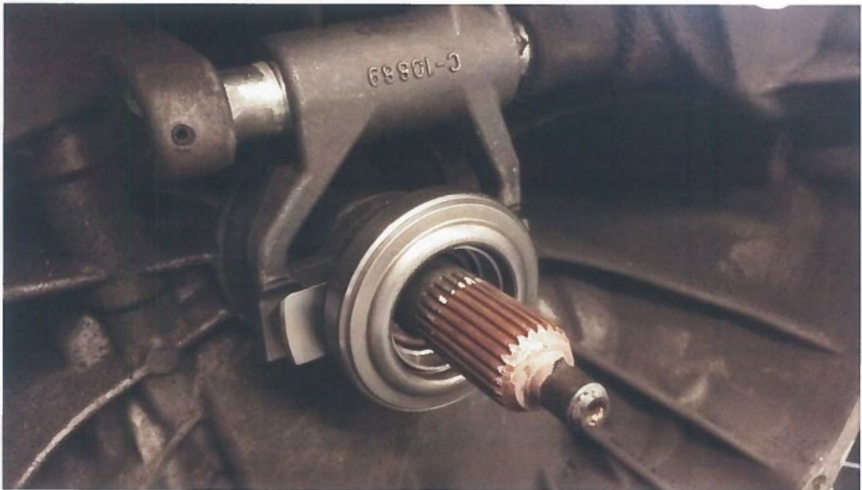
Clutch fork and bearing installed